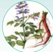
DanShen ( Salvia Miltiorrhiza )